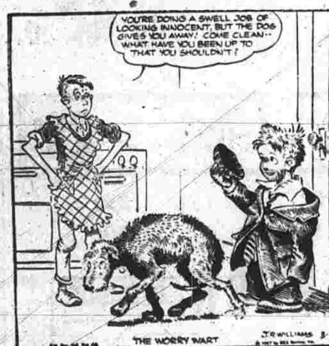
OUR WAY BY J. R. WILLIAMS