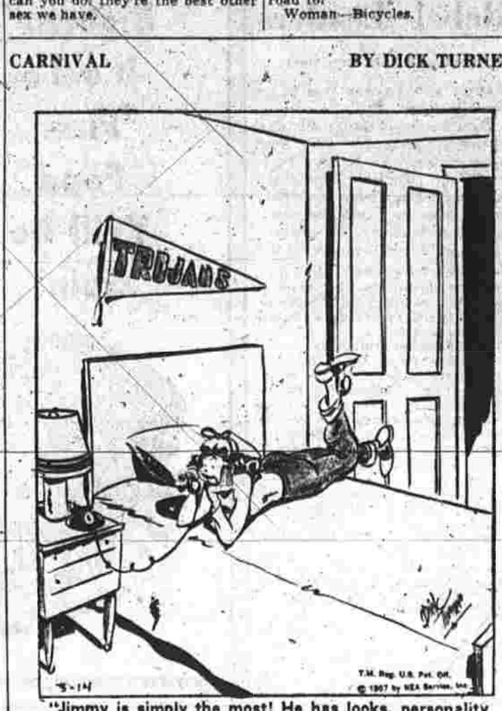
CARNIVAL BY DICK TURNER